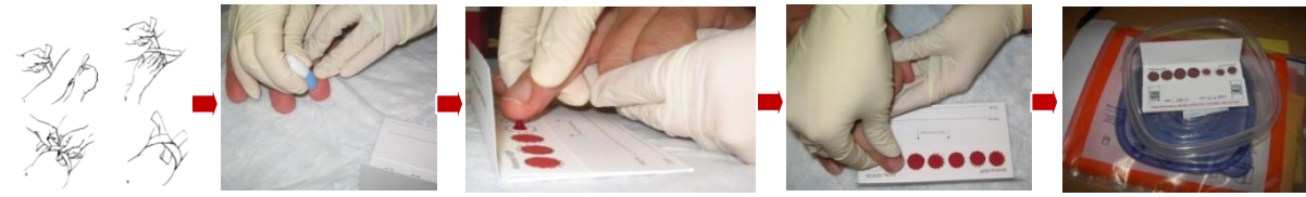
Exhibit 2. Collecting the capillary whole blood.

When seven capillary whole blood spots were successfully collected (or blood droplet formation ceased), FIs wiped off remaining blood with gauze, instructed respondents to firmly apply the gauze to the finger for at least two minutes, and then applied a band aid to it. FIs collecting fewer than five spots less than 80% full from a single prick requested respondents' permission to repeat the capillary whole blood collection procedure on a second finger from the contralateral hand. FIs asked respondents to discard used capillary whole blood collection equipment in their own trash receptacle (except for lancets which were discarded in the biohazard container). FIs discarded them in the biohazard container when interviews were conducted in public locations.